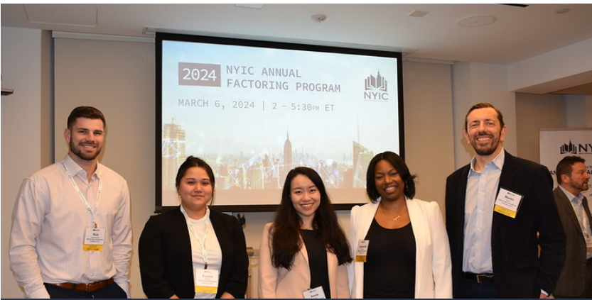
2024 Annual Factoring Program