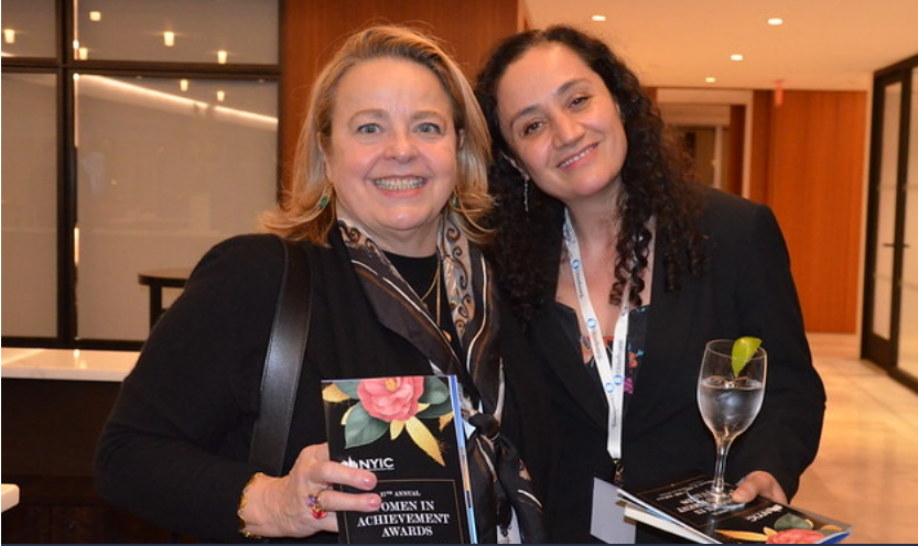
2024 Annual Women's in Achievement Awards